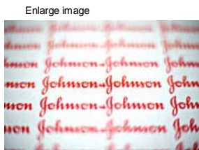
Enlarge image Johnson & Johnson's unauthorized sales might cost it more to resolve lawsuits over the product.

J&J's Ethicon unit introduced the Gynecare Prolift device in March 2005, touting it in an annual report as an "innovative and effective surgical option" for weakened pelvic muscles. The U.S. Food and Drug Administration said it learned of the Prolift in 2007, when J&J sought approval for a related product. The FDA cleared both devices in May 2008.